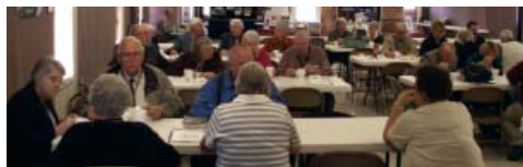
[above] Twenty-eight people gathered for a Sunday School fellowship luncheon. Ideas were shared and resources were given away.