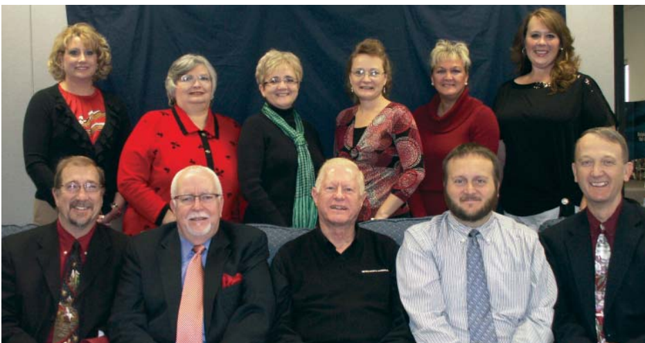
Your convention staff wishes for you the merriest of Christmases and a happy, healthy, and prosperous New Year!