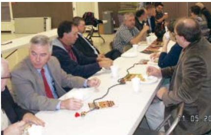
About a dozen people interested in learning more about the East Asia partnership gathered for breakfast on Saturday morning.