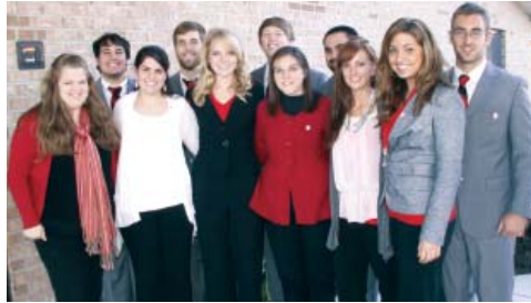
The North Greenville University's "Joyful Sound" provided special music for the meetings.